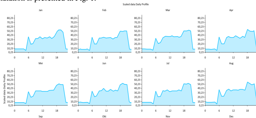
Fig. 1. The monthly load profile for island communities in Miangas Island.

The monthly load profile of electricity demand for Miangas island community for one year that used in HOMER simulation is presented in Fig. 1.