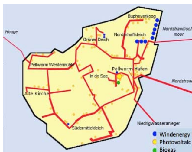
Fig. 2. Schematic overview of the decentralised energy generation Pellworm [5].

Fig. 2 shows the structure of the medium-high-voltage system and the position of the decentralised generation systems. Besides the hybrid plant from wind- and photovoltaic power plants of E.ON-Hanse Wärme GmbH, more than 100 additional decentralised generation systems from renewable energy energize into the low-voltage and medium-voltage 20kV grid from the grid operator Schleswig-Holstein Netz AG.